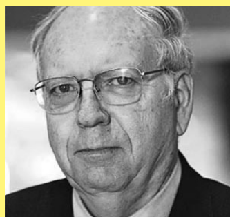
AMB. EFRAIM HALEVY