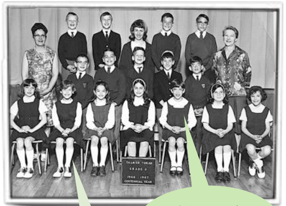
Class of '71 in Grade 3

We welcome your feedback about this newsletter. Please share with us your comments and suggestions by sending an e-mail to info@talmudtorah.com